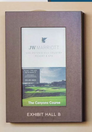
◀ Meeting room display - 22"