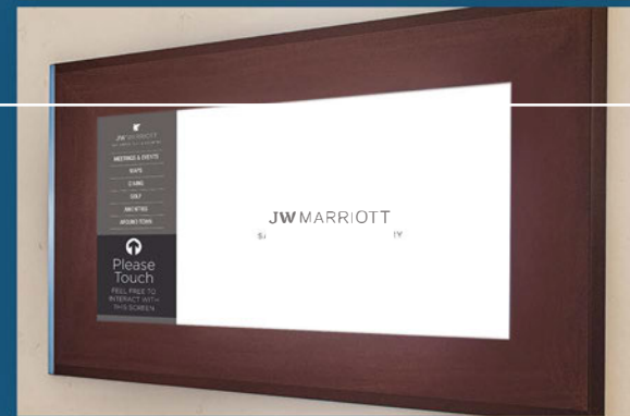
▲ Interactive Readerboards 43" ▶